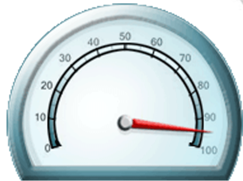
Overall Performance Rating